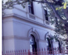
former customs house cnr nelson place and syme st williamstown close up windows she project 2003