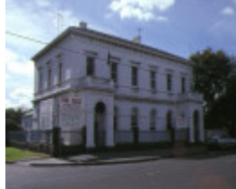
1 former customs house nelson place williamstown front view