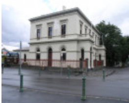
FORMER CUSTOMS HOUSE SOHE 2008