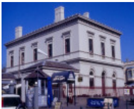
former customs house cnr nelson place and syme st williamstown cnr view she project 2003