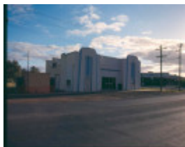
H01985 wimmera stock bazaar northeast dec01