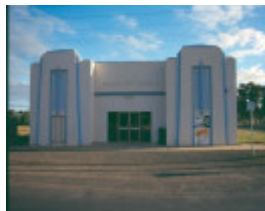
H01985 wimmera stock bazaar front dec01