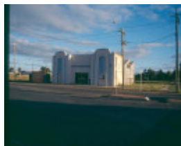
H01985 wimmera stock bazaar north dec01