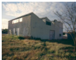
H01985 wimmera stock bazaar southeast dec01