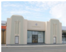
FORMER WIMMERA STOCK BAZAAR SOHE 2008