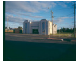
H01985 wimmera stock bazaar north dec01