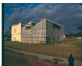
Wimmera Stock Bazaar Southwest December 2001