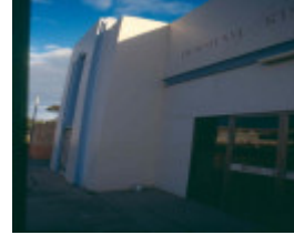
H01985 wimmera stock bazaar front detail dec01