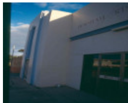
H01985 wimmera stock bazaar front detail dec01