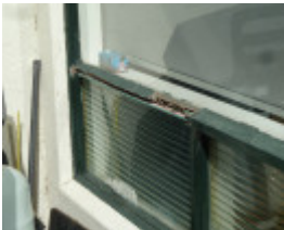
H0927 DRESSING PAVILION LHA 2015 4.JPG