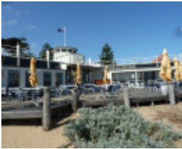
H0927 DRESSING PAVILION LHA 2015 1.JPG