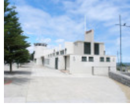
DRESSING PAVILION SOHE 2008