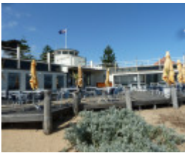
H0927 DRESSING PAVILION LHA 2015 1.JPG