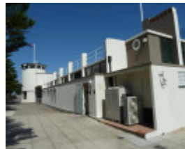
H0927 DRESSING PAVILION LHA 2015 2.JPG