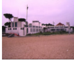
1 dressing pavillion the esplanade williamstown rear view from beach