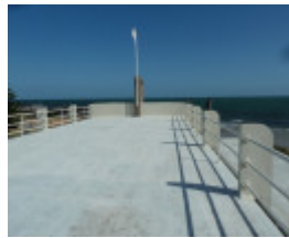
H0927 DRESSING PAVILION LHA 2015 3.JPG