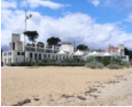
DRESSING PAVILION SOHE 2008