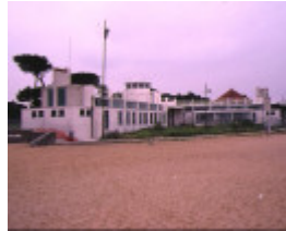
1 dressing pavillion the esplanade williamstown rear view from beach