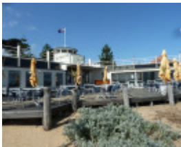
H0927 DRESSING PAVILION LHA 2015 1.JPG