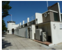
H0927 DRESSING PAVILION LHA 2015 2.JPG