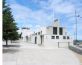
DRESSING PAVILION SOHE 2008