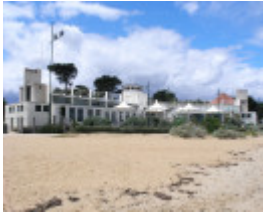
DRESSING PAVILION SOHE 2008