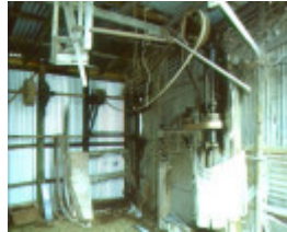
H01965 stonemasons yard kyneton jenny lind aug01