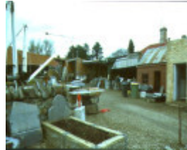
H01965 stonemasons yard kyneton aug01