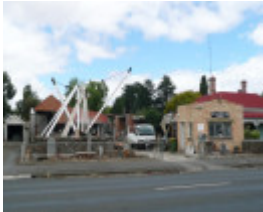
STONEMASONS YARD SOHE 2008