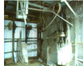
H01965 stonemasons yard kyneton jenny lind aug01