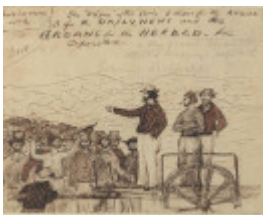
1854 Pen and ink sketch of speakers at the Monster Meeting (artist unknown)