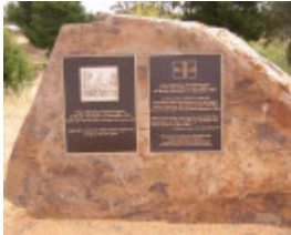
Monument at the Monster Meeting Site, erected by the Ballarat Reform League Inc. on registered land