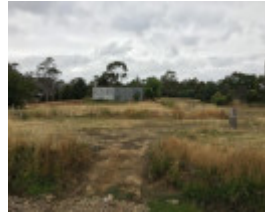
Photo taken from a location similar to that in the 1851 engraving