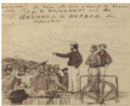
1854 Pen and ink sketch of speakers at the Monster Meeting (artist unknown)