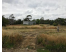
Photo taken from a location similar to that in the 1851 engraving