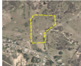
monster meeting site air photo.JPG