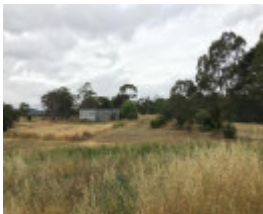
Monster Meeting site