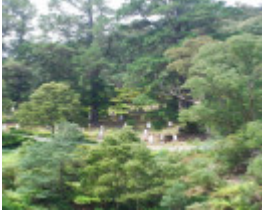
WALHALLA CEMETERY SOHE 2008