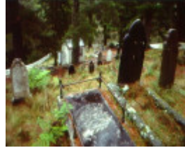
H01976 walhalla cemterey