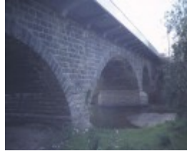
1 bridge over barwon river winchelsea arch detail jun1984