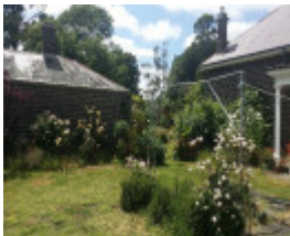
Homestead precinct north east.jpg