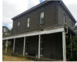
Ingleby South east elevation 2016.jpg