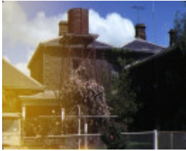
1 ingleby homestead & outbuildings ingleby rd winchelsea rear view