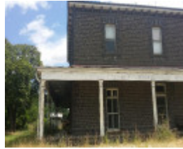
Ingleby Southern Elevation 2016.jpg