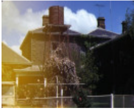
1 ingleby homestead & outbuildings ingleby rd winchelsea rear view