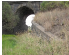
123524_Cowies Creek Rail Bridge No2_Geelong_HV_5 Feb 2010_009_resize.jpg