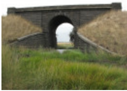
123524_Cowies Creek Rail Bridge No2_Geelong_HV_5 Feb 2010_001.jpg