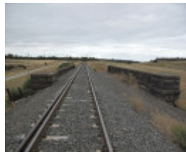
123524_Cowies Creek Rail Bridge No2_Geelong_HV_5 Feb 2010_013_resize.jpg