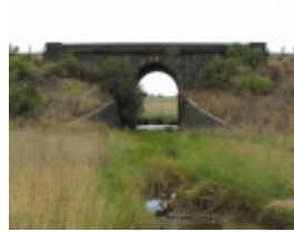
123524_Cowies Creek Rail Bridge No2_Geelong_HV_5 Feb 2010_002.jpg