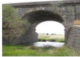
123524_Cowies Creek Rail Bridge No2_Geelong_HV_5 Feb 2010_003.jpg