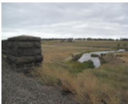
123524_Cowies Creek Rail Bridge No2_Geelong_HV_5 Feb 2010_015_resize.jpg