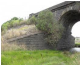
123524_Cowies Creek Rail Bridge No2_Geelong_HV_5 Feb 2010_007_resize.jpg