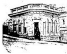
State bank -"Sturt Street, Ballarat c. 1861 S.L.V.. H2068 Film 2 / Frame 1 - Ballarat Conservation Study, 1978