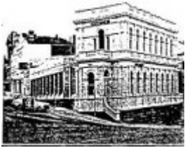
State bank - - Film 2 / Frame 1 - Ballarat Conservation Study, 1978