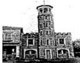
ballarat City Fire Station - Film 3 / Frame 22 - Ballarat Conservation Study, 1978