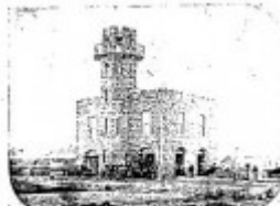
ballarat City Fire Station - c.1861 SLV - Ballarat Conservation Study, 1978