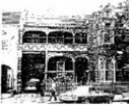
708 Sturt Street - - Film 3 / Frame 28 - Ballarat Conservation Study, 1978