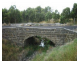
BRIDGE SOHE 2008