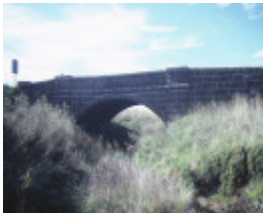
1 bridge over youls creek woolsthorpe side view jun1984