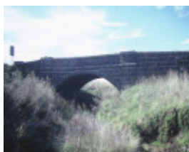
1 bridge over youls creek woolsthorpe side view jun1984