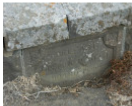
BRIDGE SOHE 2008