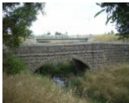
BRIDGE SOHE 2008