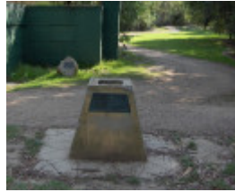
Wilson Reserve full size.jpg