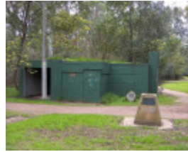
Wilson Reserve - memorial den.jpg