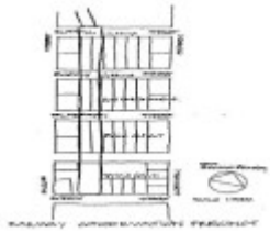
Railway Conservation Precinct - 1983 Buninyong Conservation Study