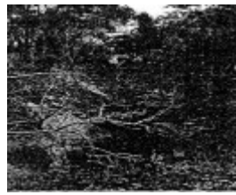
Railway Conservation Precinct - view of railway cutting from Barkley street - 1983 Buninyong Conservation Study