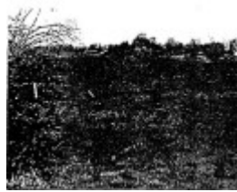
Railway Conservation Precinct - View of railway line embankment and brick culvert - 1983 Buninyong Conservation Study