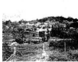
Railway Conservation Precinct - Panoramic view of Buninyong from former Railway Reserve - 1983 Buninyong Conservation Study