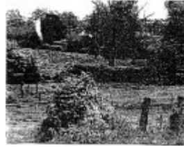
Colemans Spring Conservation Precinct - view of Coleman's Spring looking west sowing Stand Pump - 1983 Buninyong Conservation Study