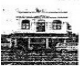
Former Eagle Hotel, 507 Warrenheip Street, Buninyong - 1983 Buninyong Conservation Study