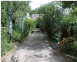
H01955 cuming garden drive