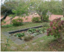
H01955 1 cuming garden pond