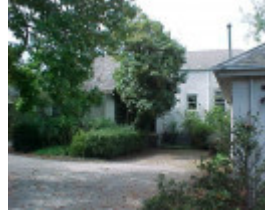
H01955 cuming garden back