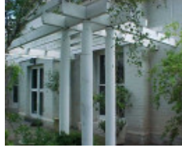
H01955 cuming garden colonnade