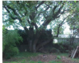
H01955 cuming garden oak tree