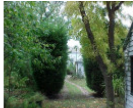
H01955 cuming garden square cypress