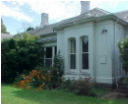
H01955 cuming garden side