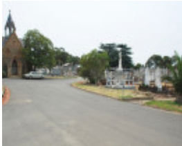
BENDIGO CEMETERY SOHE 2008