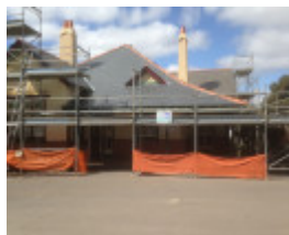
During Photographs - Reference F3843 2015