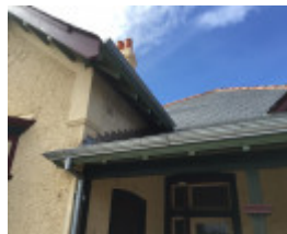
After Photographs - Reference F3843 2016