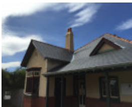
After Photographs - Reference F3843 2016