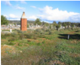
h00798 bendigo cemetery chinese section 03 08 03 mz