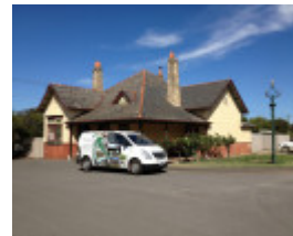
Before Photographs - Reference F3843 2014