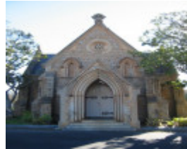
Bendigo Cemetery Chapel August 2003