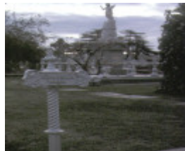
h00798 bendigo cemetery view of headstones