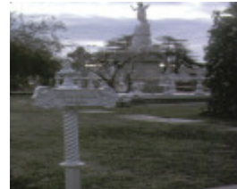
h00798 bendigo cemetery view of headstones