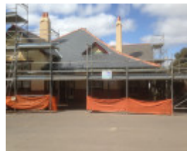
During Photographs - Reference F3843 2015