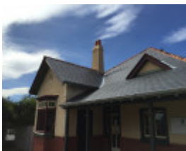
After Photographs - Reference F3843 2016