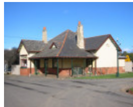
h00798 bendigo cemetery sextons lodge 08 03 mz