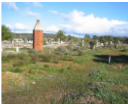
h00798 bendigo cemetery chinese section 03 08 03 mz