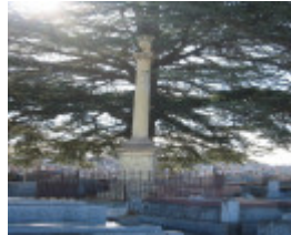
h00798 bendigo cemetery burke wills memorial 08 03 mz