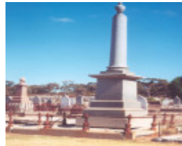
h00798 bendigo cemetery mackay monument