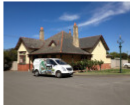
Before Photographs - Reference F3843 2014