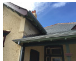
After Photographs - Reference F3843 2016