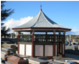
h00798 bendigo cemetery gazebo 08 03 mz