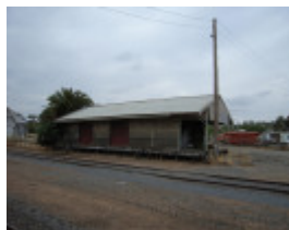
WYCHEPROOF RAILWAY STATION SOHE 2008