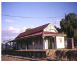
1 wycheproof railway station compelx peel street windsor track view may1984