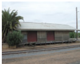
WYCHEPROOF RAILWAY STATION SOHE 2008