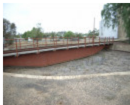
WYCHEPROOF RAILWAY STATION SOHE 2008