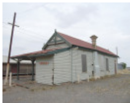
WYCHEPROOF RAILWAY STATION SOHE 2008