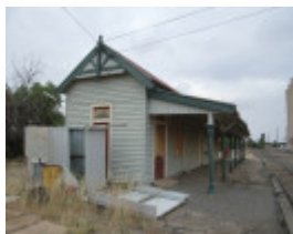
WYCHEPROOF RAILWAY STATION SOHE 2008