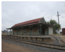
WYCHEPROOF RAILWAY STATION SOHE 2008