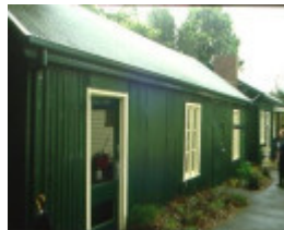
H01459 h1459 rbg prefab iron house in nursery oct 2001