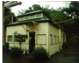
H01459 h1459 rbg paint shop in nursery oct 2001