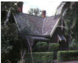
H01459 royal botanic Under gardener's cottage sep1981