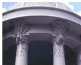
Royal Botanic Gardens Birdwood Avenue South Yarra Temple of the Winds Capital Detail September 1981