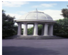
H01459 royal botanic gardens birdwood avenue south yarra temple of the winds sep1981