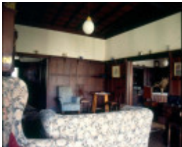
H02004 macgeorge house ivanhoe living room 02