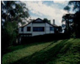
H02004 macgeorge house ivanhoe south side from river 02