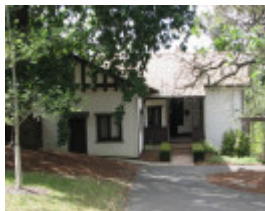
MACGEORGE HOUSE SOHE 2008