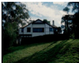
H02004 macgeorge house ivanhoe south side from river 02