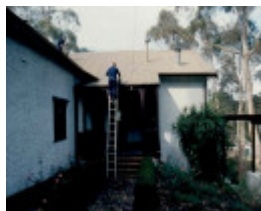
H02004 macgeorge house ivanhoe porch 02