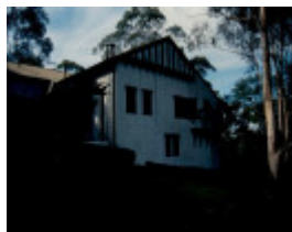
H02004 macgeorge house ivanhoe west side 02