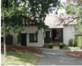
MACGEORGE HOUSE SOHE 2008