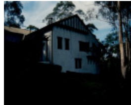
H02004 macgeorge house ivanhoe west side 02