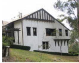
MACGEORGE HOUSE SOHE 2008