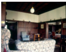
H02004 macgeorge house ivanhoe living room 02