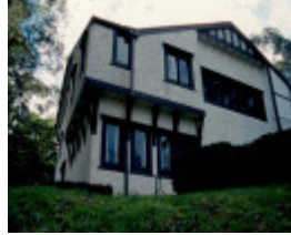
H02004 macgeorge house ivanhoe south side 02