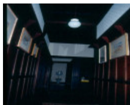
H02004 macgeorge house ivanhoe hallway 02