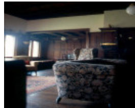
H02004 macgeorge house ivanhoe living 02