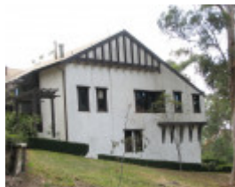
MACGEORGE HOUSE SOHE 2008