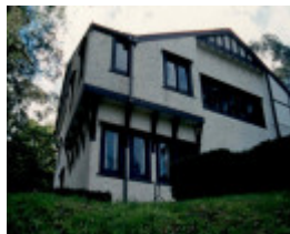
H02004 macgeorge house ivanhoe south side 02