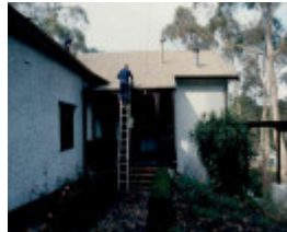
H02004 macgeorge house ivanhoe porch 02