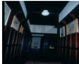
H02004 macgeorge house ivanhoe hallway 02