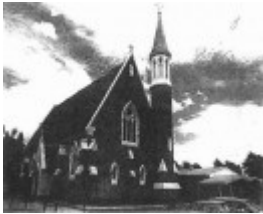
St Bernard's Church, Presbytery and Parish Centre,