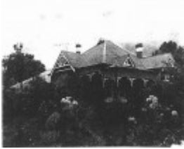
House, 69 Lerderderg Street, Bacchus Marsh