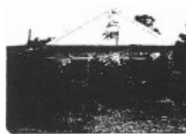
second part Hobbler Cottage