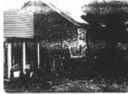
original Hobbler Cottage