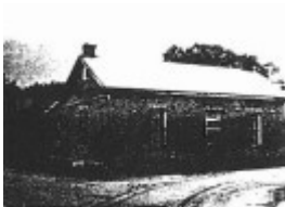
Later Hobbler Cottage