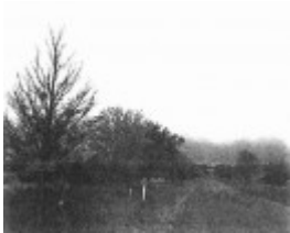
Avenue of Honour (World War I)