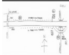
Avenue of Honour (World War I)