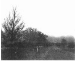
Avenue of Honour (World War 1)