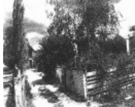
House, 8 Main Street. Mymiong