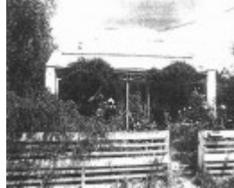
House, 8 Main Street. Mymiong