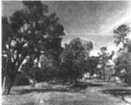
Plough Inn Hotel.