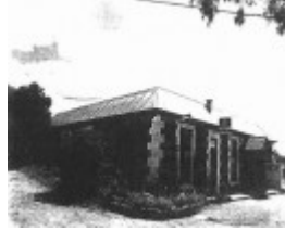
Plough Inn Hotel.