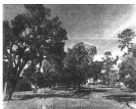
Plough Inn Hotel.