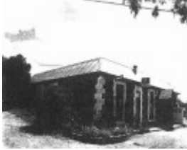
Plough Inn Hotel.