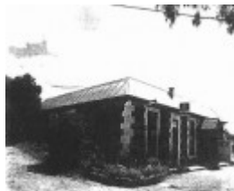
Plough Inn Hotel.