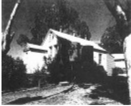
Coimadai Primary School. No.716