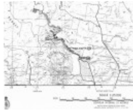
Ambler Lane (FWD), Break Neck Gully (North of O'Brien's Crossing).