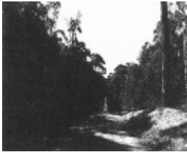
Ambler Lane (FWD), Break Neck Gully (North of O'Brien's Crossing).