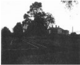
Bacchus Marsh Lawn Tennis Club Inc.