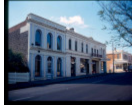
h02039 kyneton piper street shops exterior