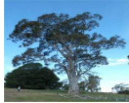
T12201 Eucalyptus blakelyi