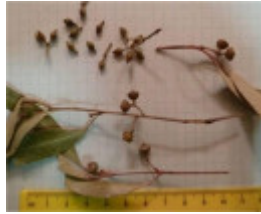
T12201 Eucalyptus blakelyi