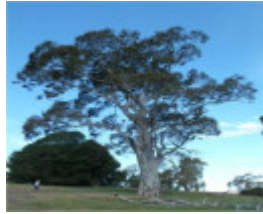
T12201 Eucalyptus blakelyi