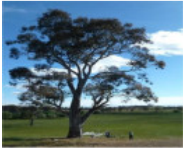
T12201 Eucalyptus blakelyi