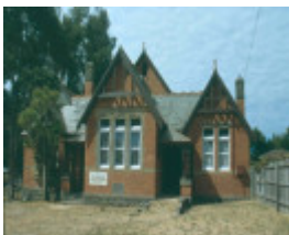
H01989 former congreg sunday school kyneton