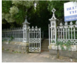
KYNETON ARTS CENTRE (FORMER CONGREGATIONAL CHURCH AND SUNDAY SCHOOL) SOHE 2008