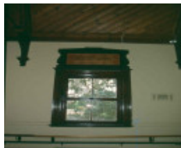
H01989 former congreg sunday school interior