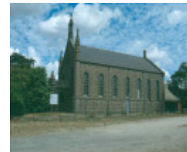
H01989 former congreg church kyneton1