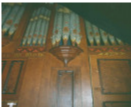
H01989 former congreg church kyneton organ