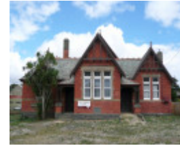
KYNETON ARTS CENTRE (FORMER CONGREGATIONAL CHURCH AND SUNDAY SCHOOL) SOHE 2008