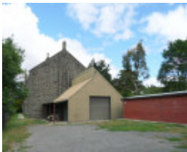
KYNETON ARTS CENTRE (FORMER CONGREGATIONAL CHURCH AND SUNDAY SCHOOL) SOHE 2008