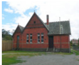
KYNETON ARTS CENTRE (FORMER CONGREGATIONAL CHURCH AND SUNDAY SCHOOL) SOHE 2008