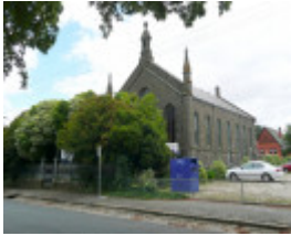
KYNETON ARTS CENTRE (FORMER CONGREGATIONAL CHURCH AND SUNDAY SCHOOL) SOHE 2008