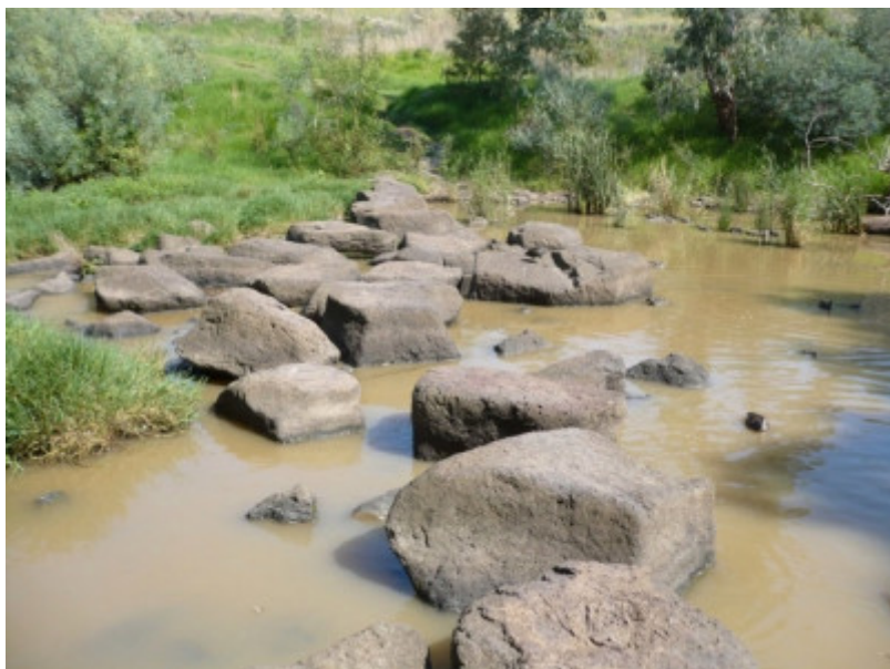
soloman's ford looking west