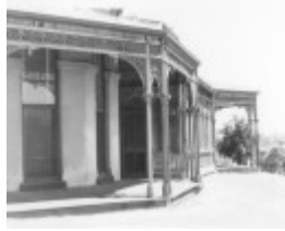
B1207 Clovelly North side looking west.jpg