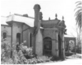
B1207 Clovelly Front Porch.jpg