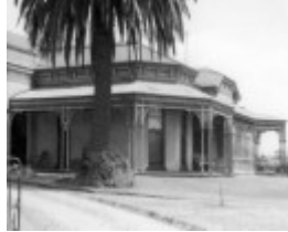
B1207 Clovelly NE Corner from Gate.jpg