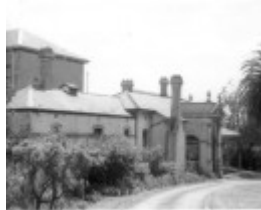
B1207 Clovelly East side on Lansell Road.jpg