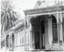
B1207 Clovelly Front Entrance3.jpg