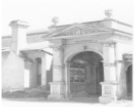
B1207 Clovelly Front Entrance2.jpg