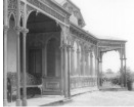
B1207 Clovelly Front Entrance1.jpg