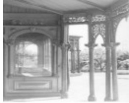
B1207 Clovelly North Verandah.jpg