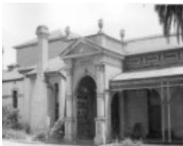
B1207 Clovelly Front Entrance4.jpg