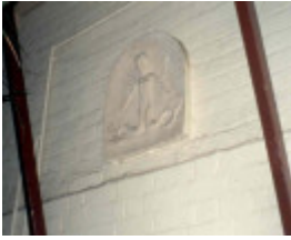
Ola Cohn House Wall Plaque