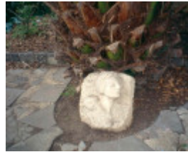
Ola Cohn House Sculpture