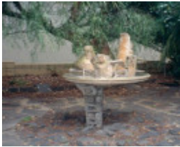
Ola Cohn House Sculpture