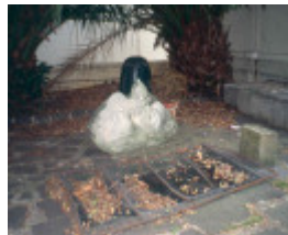
Ola Cohn House Sculpture