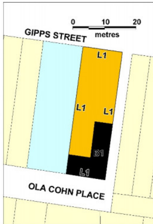
H02002 ola cohn house plan