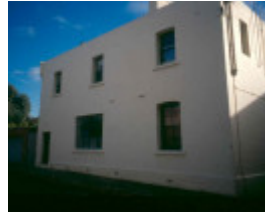
H02002 1ola cohn house