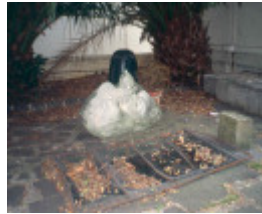
Ola Cohn House Sculpture