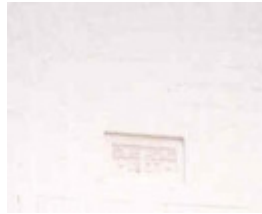
Ola Cohn House Nameplate