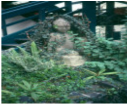
H02002 ola cohn house garden