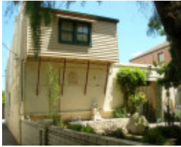
OLA COHN HOUSE SOHE 2008