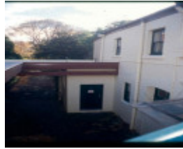
h02002 ola cohn house courtyard