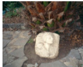
Ola Cohn House Sculpture