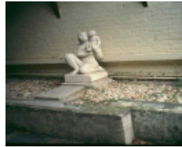
H02002 ola cohn house grave