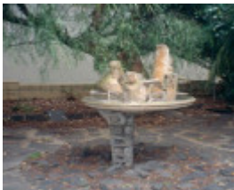
Ola Cohn House Sculpture