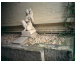
Ola Cohn House Sculpture