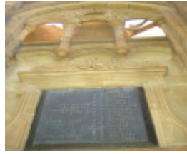
plaque3 boer war memorial stkilda rd jb