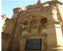
boer war memorial detail nov06 jb