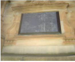
plaque1 boer war memorial st kilda rd nov06 jb