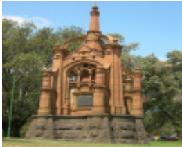
BOER WAR MONUMENT SOHE 2008