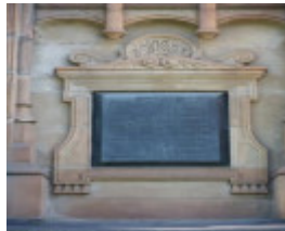
Victorian Mounted Rifles Memorial.jpg