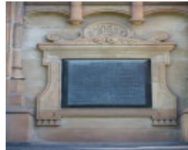
Victorian Mounted Rifles Memorial.jpg