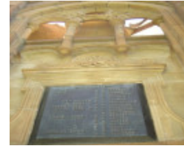
plaque3 boer war memorial stkilda rd jb