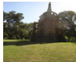
boer war memorial nov06 jb