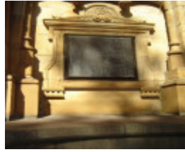
plaque2 boer war memorial stkilda rd2 nov06 jb