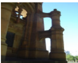
boer war memorial buttress Nov06 jb