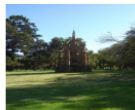
boer war memorial full view nov 06 jb