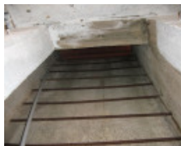
Looking up the escape hatch and air shaft at western end of building, Feb 2008.