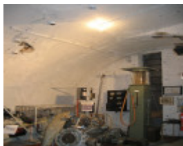
Internal view of engine room, Feb 2008.