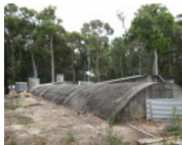
External view to the east, Feb 2008.