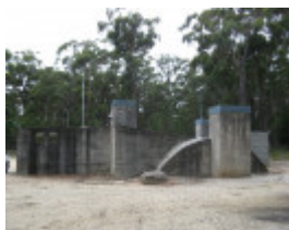
External view of western end, Feb 2008.