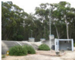
External view to the west, Feb 2008.