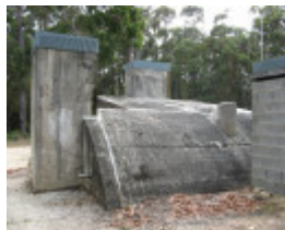
Western end, external view of engine room, Feb 2008.