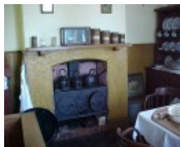
h01520 lady bay lighthouse complex kitchen jun04 pm1