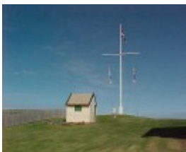
h01520 lady bay lighthouse complex flagstaff jun04 pm1