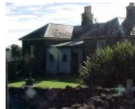
h01520 lady bay lighthouse complex cottage jun04 pm1