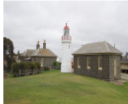
LADY BAY LIGHTHOUSE COMPLEX SOHE 2008