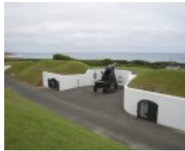
LADY BAY LIGHTHOUSE COMPLEX SOHE 2008