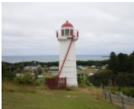
LADY BAY LIGHTHOUSE COMPLEX SOHE 2008