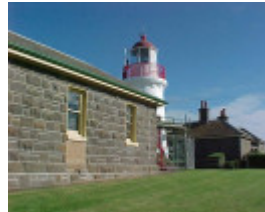
h01520 1 lady bay lighthouse complex chartroom jun04 pm1