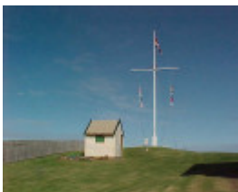
h01520 lady bay lighthouse complex flagstaff jun04 pm1