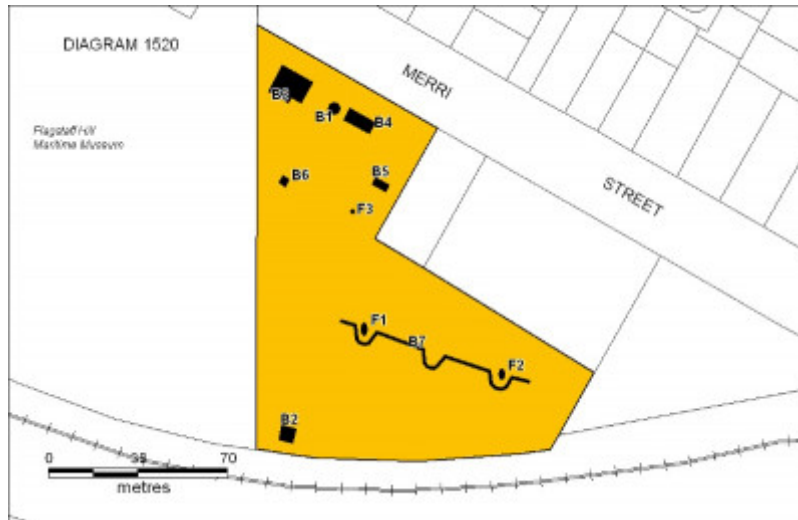
h01520 plan 2004