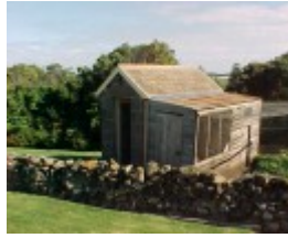
h01520 lady bay lighthouse complex privy jun04 pm1