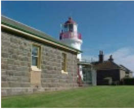
h01520 1 lady bay lighthouse complex chartroom jun04 pm1