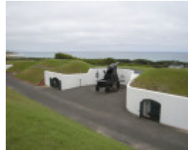
LADY BAY LIGHTHOUSE COMPLEX SOHE 2008