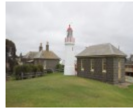
LADY BAY LIGHTHOUSE COMPLEX SOHE 2008