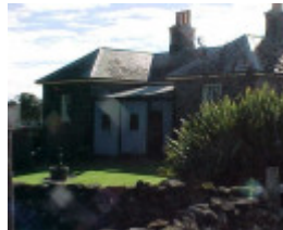
h01520 lady bay lighthouse complex cottage jun04 pm1