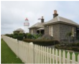
LADY BAY LIGHTHOUSE COMPLEX SOHE 2008