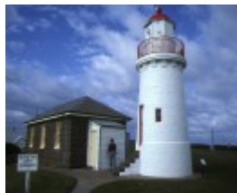
h01520 lady bay lighthouse store flagstaff hill warrnambool rear view of lighthouse may1984