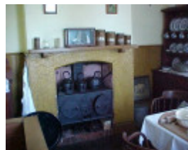
h01520 lady bay lighthouse complex kitchen jun04 pm1