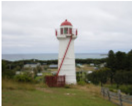
LADY BAY LIGHTHOUSE COMPLEX SOHE 2008