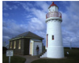
h01520 lady bay lighthouse store flagstaff hill warrnambool rear view of lighthouse may1984