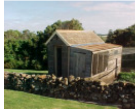
h01520 lady bay lighthouse complex privy jun04 pm1