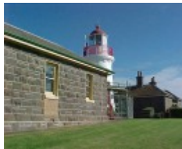
h01520 1 lady bay lighthouse complex chartroom jun04 pm1