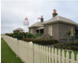
LADY BAY LIGHTHOUSE COMPLEX SOHE 2008