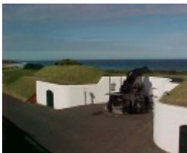
h01520 lady bay lighthouse complex battery jun04 pm1