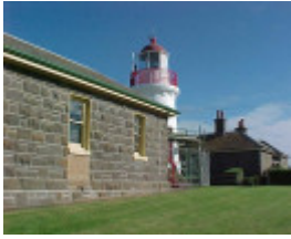
h01520 1 lady bay lighthouse complex chartroom jun04 pm1