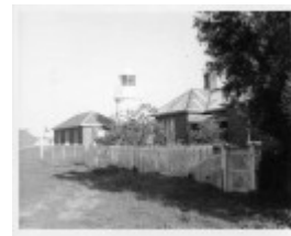
h01520 lady bay lighthouse complex 1962