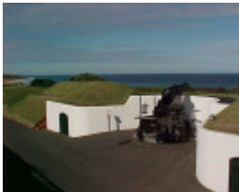
h01520 lady bay lighthouse complex battery jun04 pm1