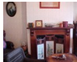
h01520 lady bay lighthouse complex living room jun04 pm1