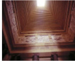
shrine of remembrance st kilda road melbourne ceiling of inner shrine