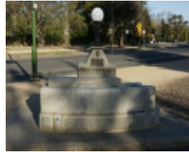
Shrine of Remembrance Horse Trough.jpg