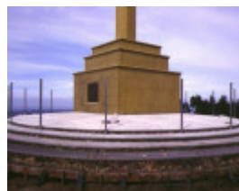
h01027 cameron memorial cross cameron drive mount macedon cross base