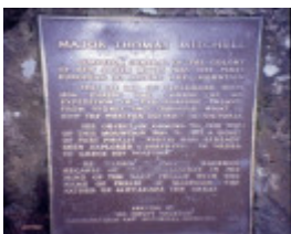
h01027 macedon cross cameron drive mt macedon plaque she project 2003