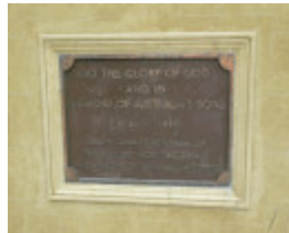
MACEDON CROSS SOHE 2008