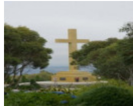
Mt Macedon Memorial Cross 2.jpg