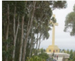
Mt Macedon Memorial Cross 3.jpg