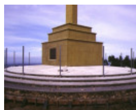
h01027 cameron memorial cross cameron drive mount macedon cross base