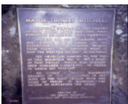
h01027 macedon cross cameron drive mt macedon plaque she project 2003