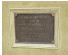
MACEDON CROSS SOHE 2008