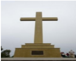
Mt Macedon Memorial Cross 1.jpg