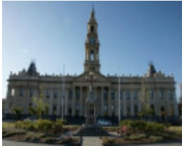
South Melbourne Boer War Memorial.jpg