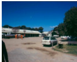
h01090 fort franklin portsea barracks and parade ground 0903 mz