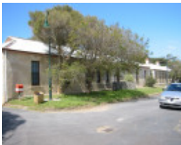
h01090 fort franklin portsea barracks 02 0903 mz