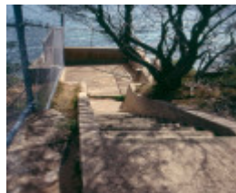
h01090 fort franklin portsea forward observation post 0903 mz