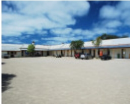
FORMER FORT FRANKLIN (PORTSEA CAMP) SOHE 2008