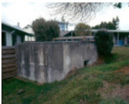
h01090 fort franklin portsea bunker 01 0903 mz