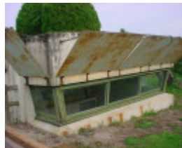
h01090 fort franklin portsea bunker observation post 01 0604 js