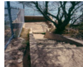
h01090 fort franklin portsea forward observation post 0903 mz