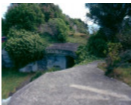
h01090 fort franklin portsea gun emplacement 01 0903 mz