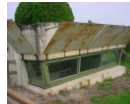
h01090 fort franklin portsea bunker observation post 01 0604 js