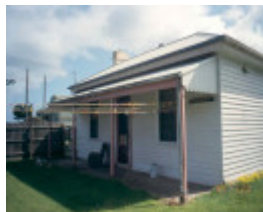
h01090 fort franklin portsea engineers cottage 01 0903 mz