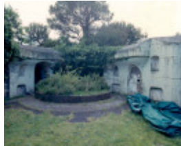
h01090 1 fort franklin portsea gun emplacement 02 0903 mz