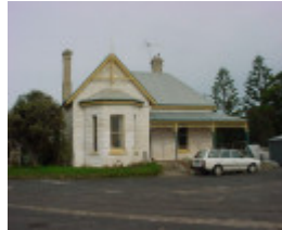
h01090 fort franklin portsea commandants house 01 0604 js