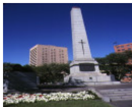
1 south african soldiers memorial albert street south melbourne front view