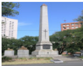
SOUTH AFRICAN SOLDIERS MEMORIAL SOHE 2008