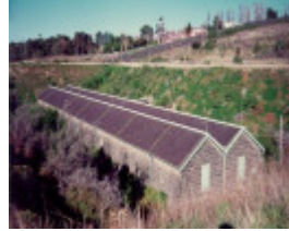
1 jacks magazine gordon street footscray magazine sep1995