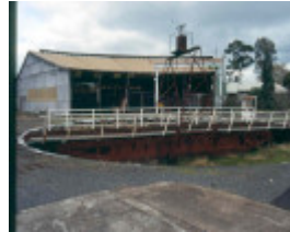
H01979 traralgon engine shed and turntable june 2001