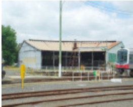
TRARALGON ENGINE SHED AND TURNTABLE SOHE 2008