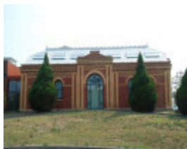
BENDIGO ART GALLERY SOHE 2008