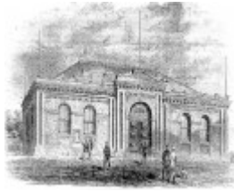
BENDIGO ART GALLERY SOHE 2008 H1172 Image001