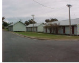
1 bonegilla migrant camp accommodation huts