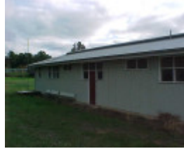
h01835 block 19 bonegilla amenities 1 pm1 jun03