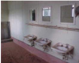
h01835 block 19 bonegilla amenities 5 pm1 jun03