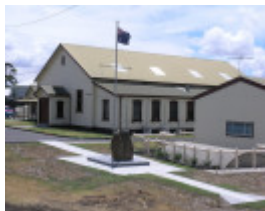
FORT GELLIBRAND SOHE 2008