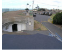
FORT GELLIBRAND SOHE 2008