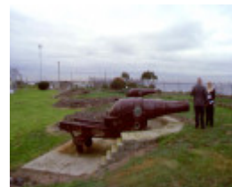
1 fort gellibrand point gellibrand williamstown gun emplacements pm2 july1999