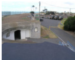
FORT GELLIBRAND SOHE 2008