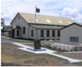
FORT GELLIBRAND SOHE 2008