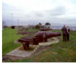
1 fort gellibrand point gellibrand williamstown gun emplacements pm2 july1999